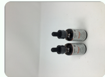
The photos on this report are of a sample collected by the lab and may vary from the final packaging.